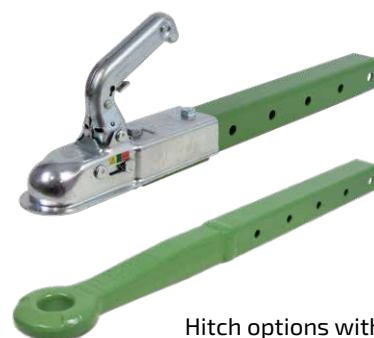
Hitch options with tow ball coupling or ring