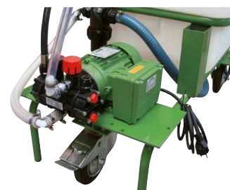
Optional front swivel castor