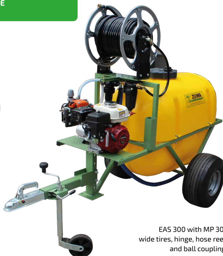
EAS 300 with MP 30, wide tires, hinge, hose reel and ball coupling