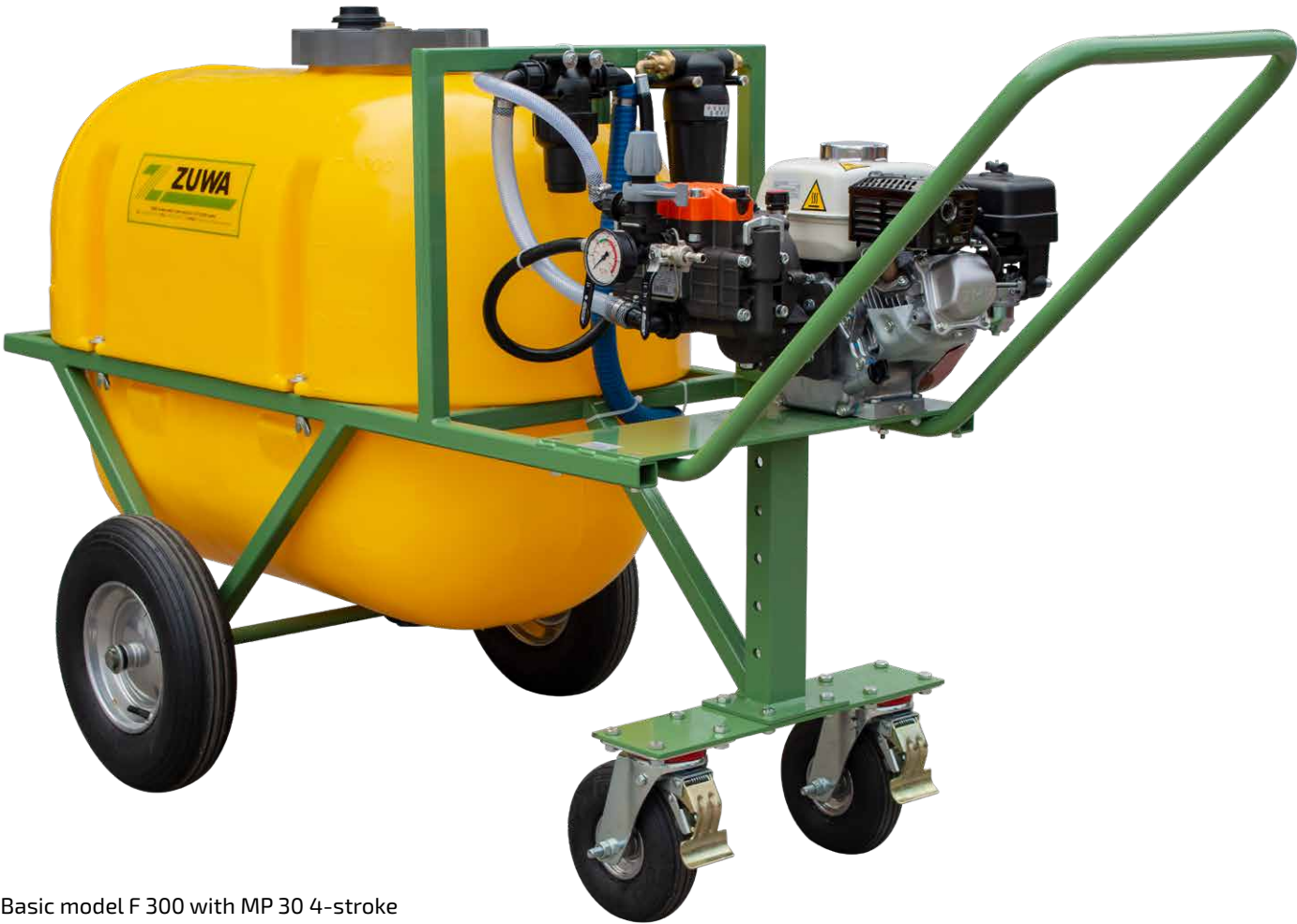
Basic model F 300 with MP 30 4-stroke