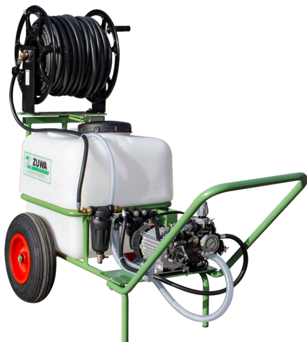
F 120 with MC 20, hinge and hose reel