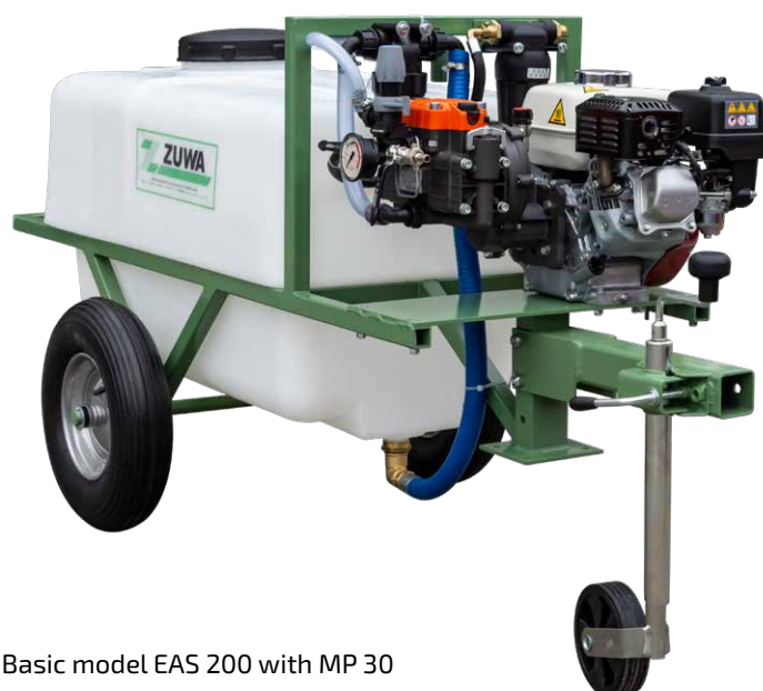
Basic model EAS 200 with MP 30